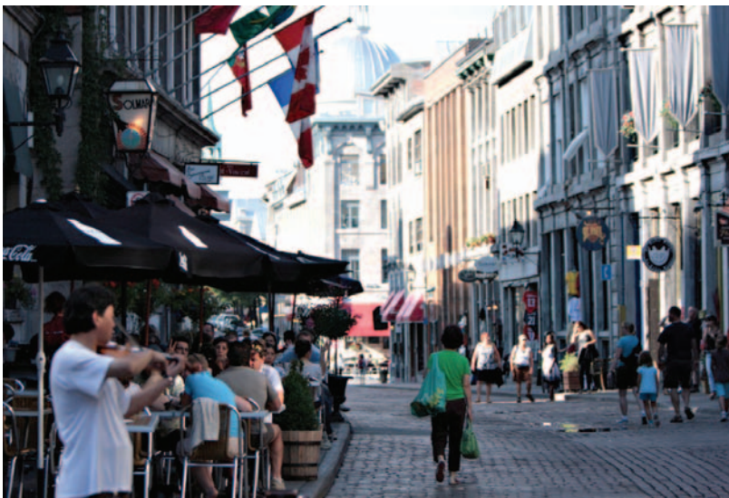
Saint-Paul Street

Two optional SOR short courses will take place in Montréal, on Using Large-Amplitude Oscillatory Shear (Ewoldt and Giacomin) and Computational Rheology via LAMMPS (Lechman, Lane, and Plimpton); for details, see the article in this Bulletin and the SOR website.