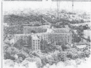
WARDMAN PARK HOTEL - WASHINGTON, D.C.