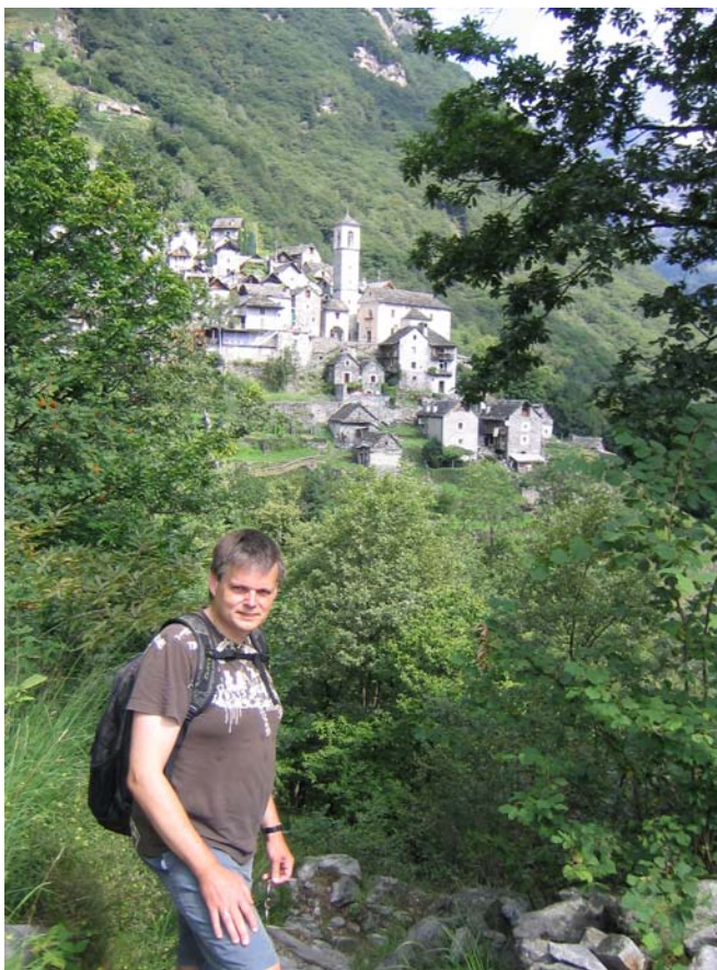
Hiking in Valle Verzasca, Ticino in July 2007.