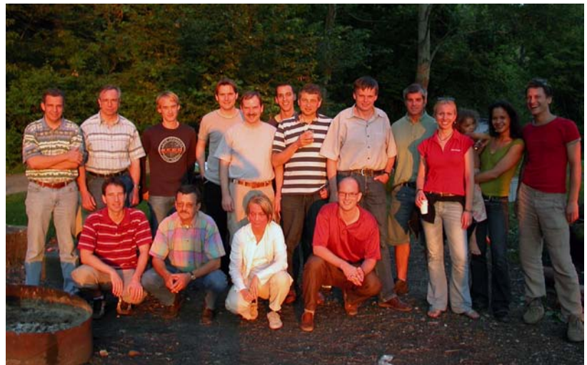
Group barbecue in July 2005.