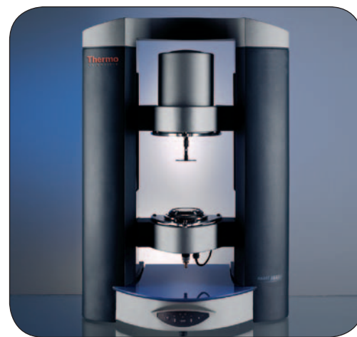
Thermo Scientific HAAKE MARS rheometer

Thermo Fisher Scientific · Dieselstr. 4 · 76227 Karlsruhe www.thermo.com/mars · info.mc.de@thermofisher.com